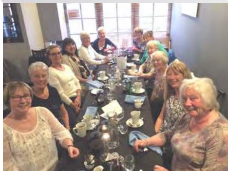
Largs & District Carers on a recent outing to the Chef's Eye, Largs where an enjoyable evening was had by all.

Largs & District Carers is a constituted group of Carers who meet three times monthly in the Brooksby Centre, Largs.