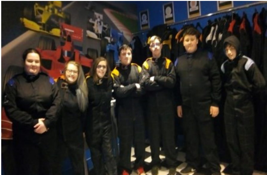
Young Carers Ready to Race