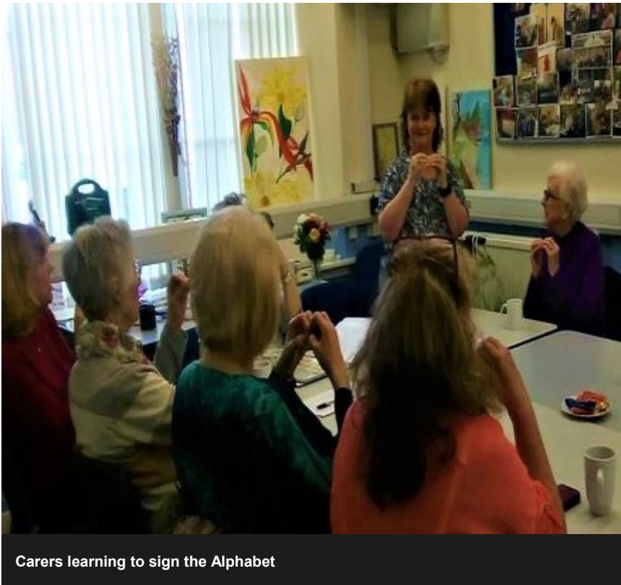
Carers learning to sign the Alphabet