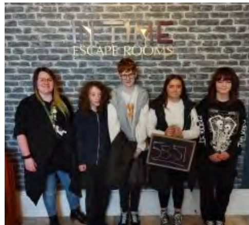
Young Carers enjoyed a recent trip to Intime Escape rooms.